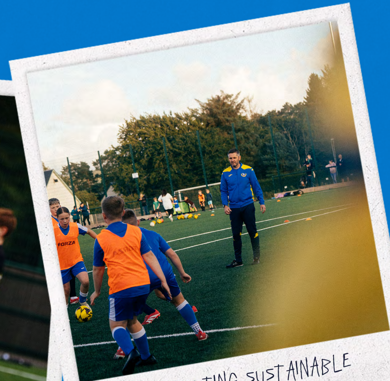
SUPPORTING SUSTAINABLE GROWTH