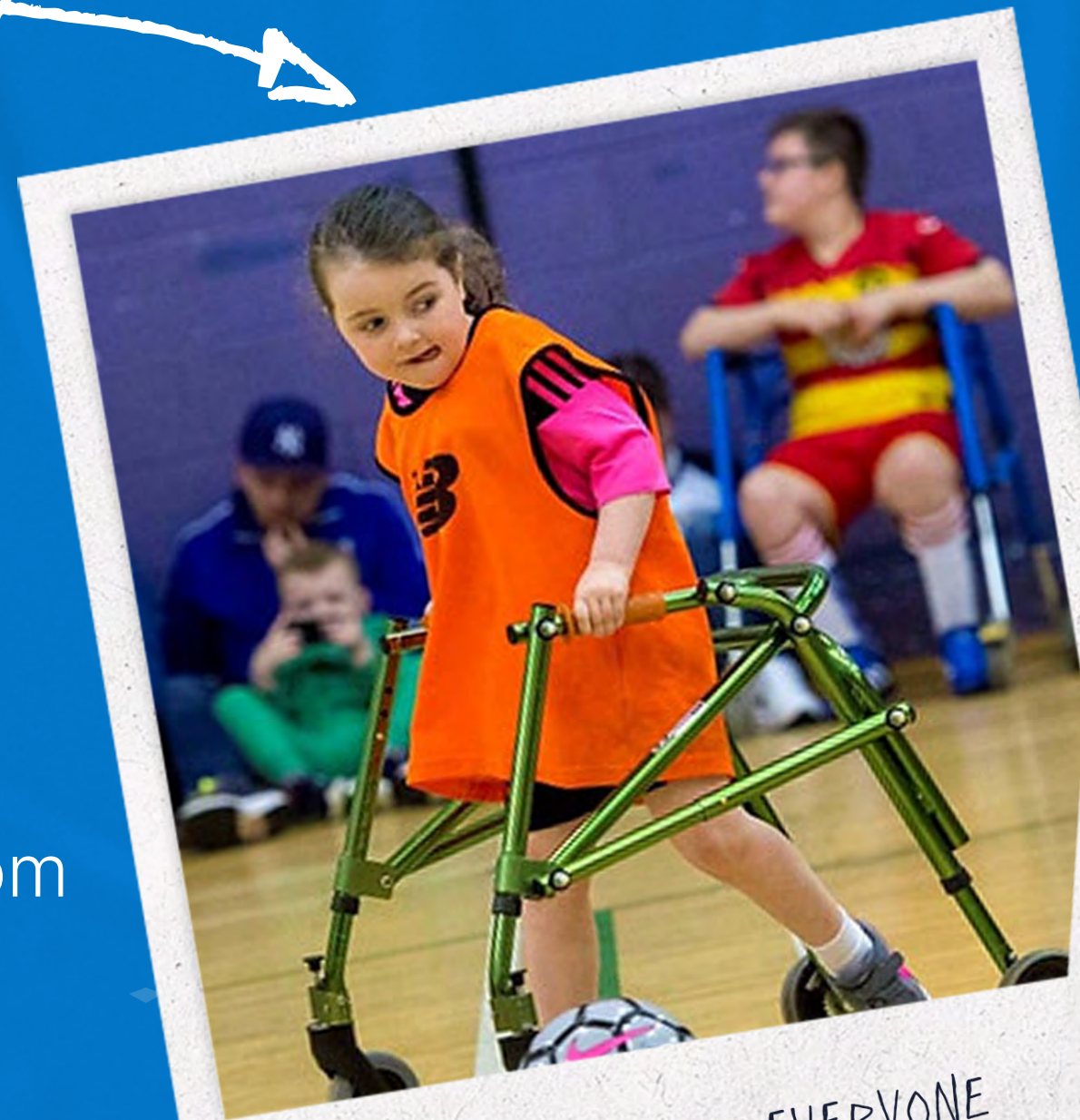
A GAME FOR EVERYONE

Create a fun and inspiring lifelong football journey from the earliest age.