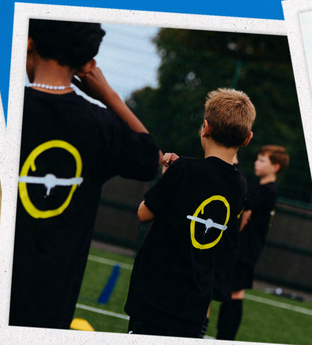
A MORE CONNECTED EXPERIENCE